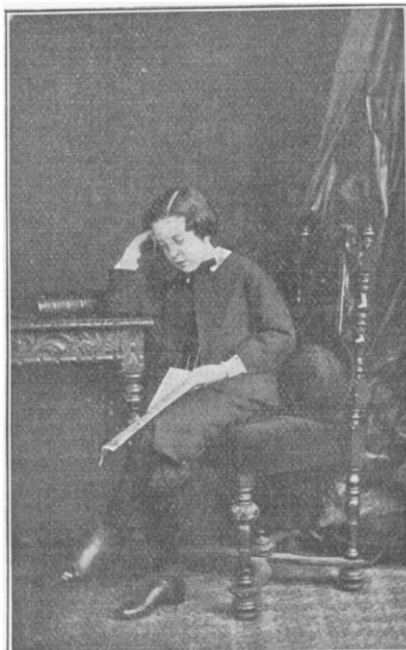
MASTER CHARLIE STANFORD. AGED 12.

Young Stanford cannot say that he was without honour in his own city of Dublin. At a concert given by the University of Dublin Choral Society (for the particulars of which we