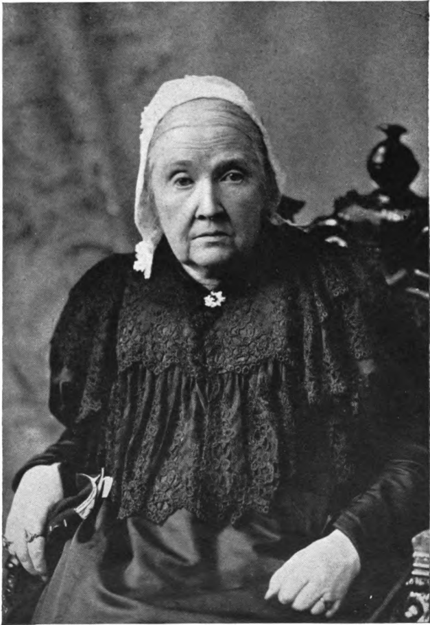
JULIA WARD HOWE