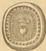
SEAL OF THE LETTER.