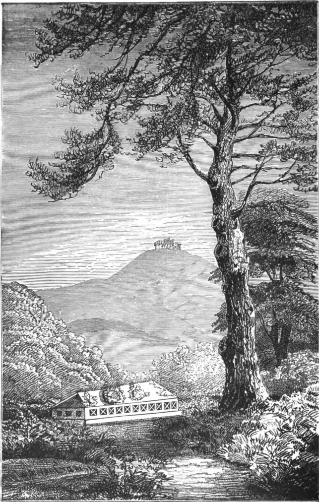
THE TOMB, ASTLEY CHURCHYARD, 1879. (FROM A DRAWING BY THE BARONESS HELGA VON CRAMM.)