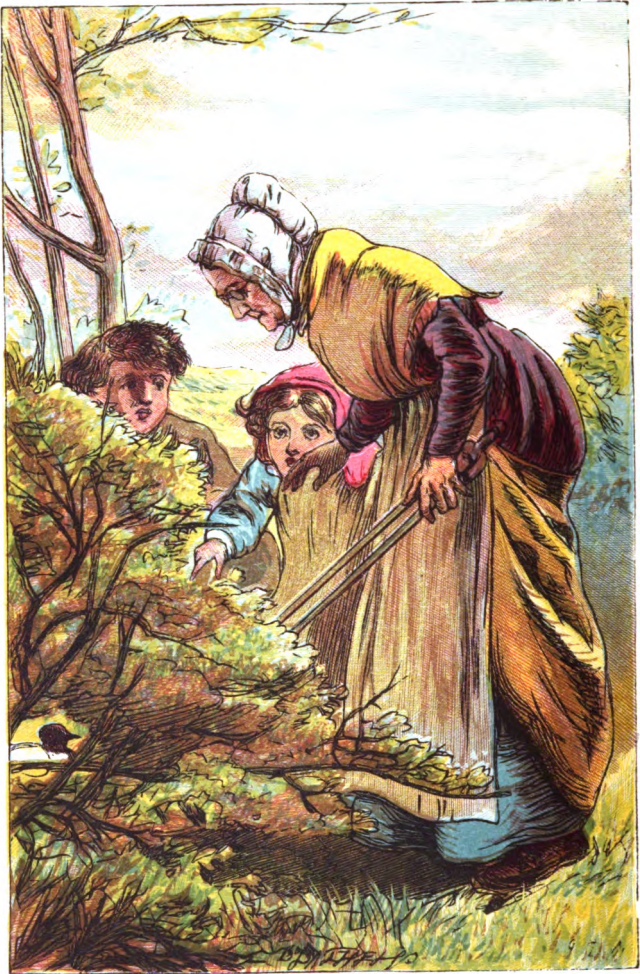
The wounded Nun.