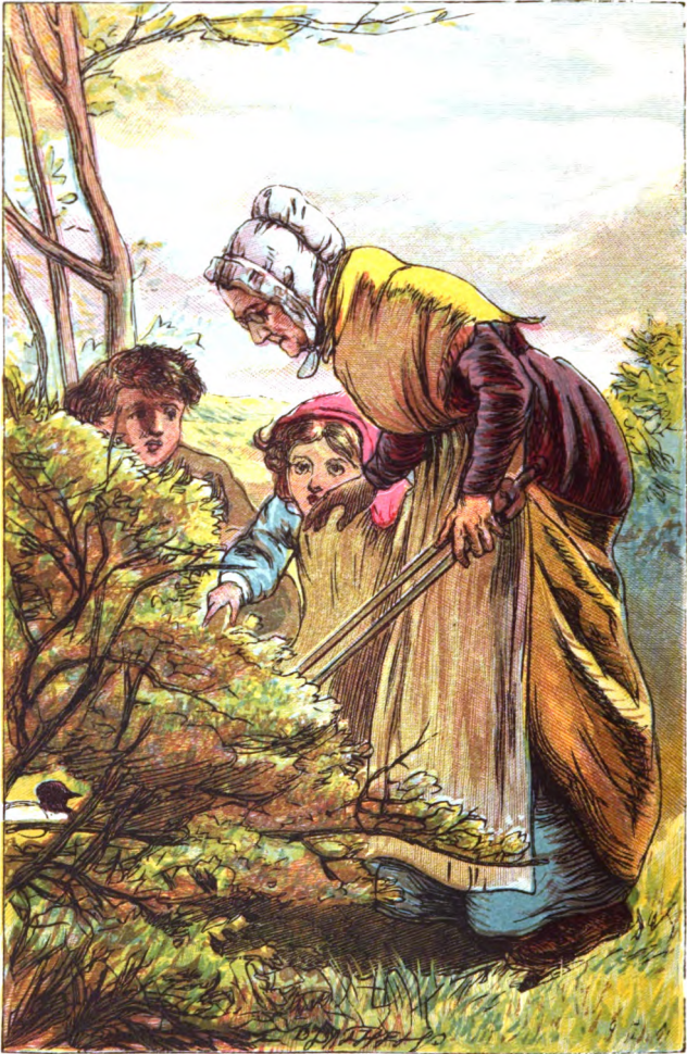
The wounded Nun.