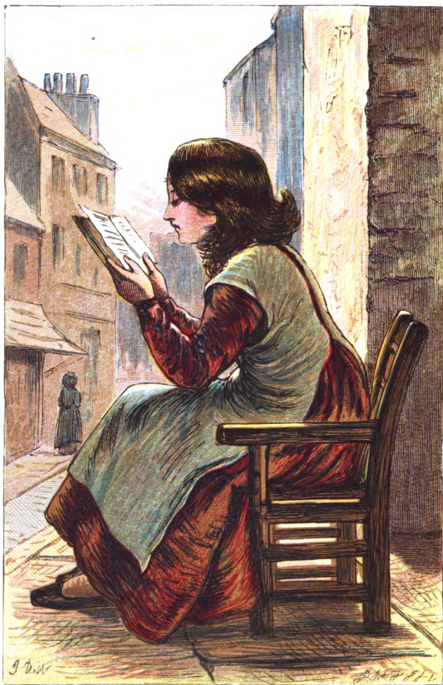
The Hymn Book.