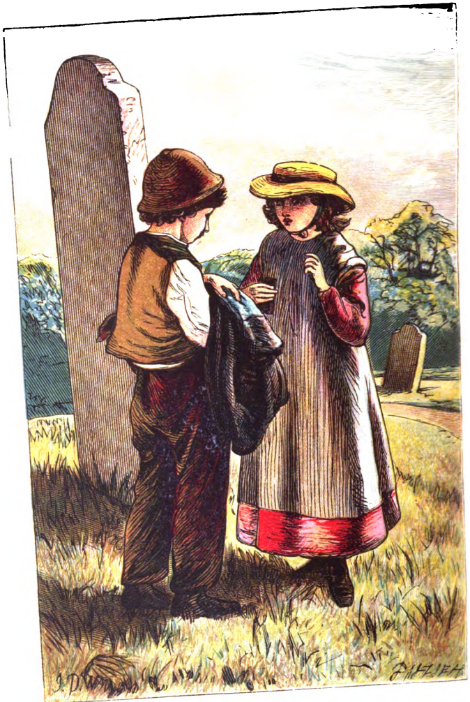
The Blue Patches